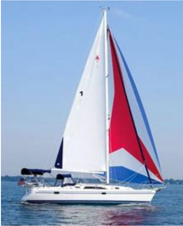
View of Catalina 355

Catalina 34 and Catalina 36 in future years.