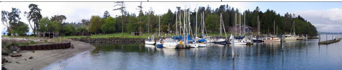
CATSS at Blake Island in 2006