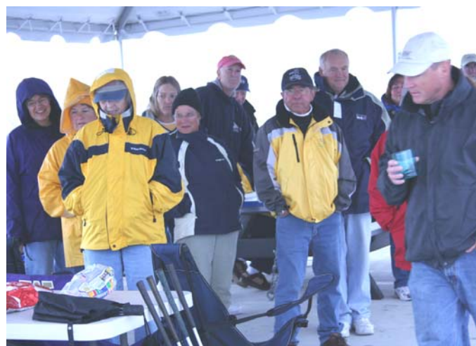
The gallery watching the golf event under shelter

Most of those I talked with seemed to enjoy the group dinner at Anthonys in lieu of our typical pot luck. With the rain coming down all day Saturday it was especially nice to sit down in a restaurant and just order what you want.