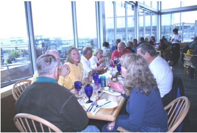
One of the five tables reserved at Anthonys.