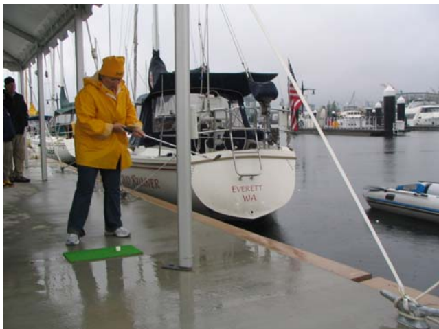
This contestant had an advantage as the target moved closer, but she was studying that soggy mallow and thought some Pam sprayed on the club might help the release of a sticky mallow when hit.

We were prepared with a couple other games, but with 40 golfing contestants it took quite awhile to complete all of their tee times. Maybe next year we can try one of the other activities. We reserved the same docks for the third weekend in September 2009. That is September 18, 19 and 20, 2009.