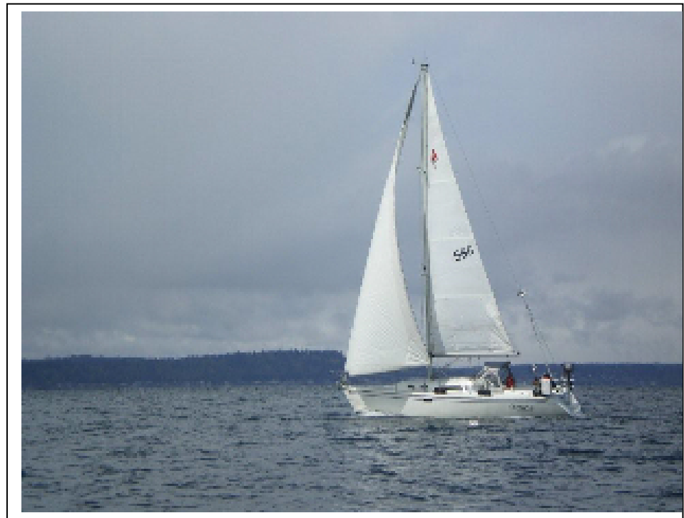
Odysseus underway on the trip home.