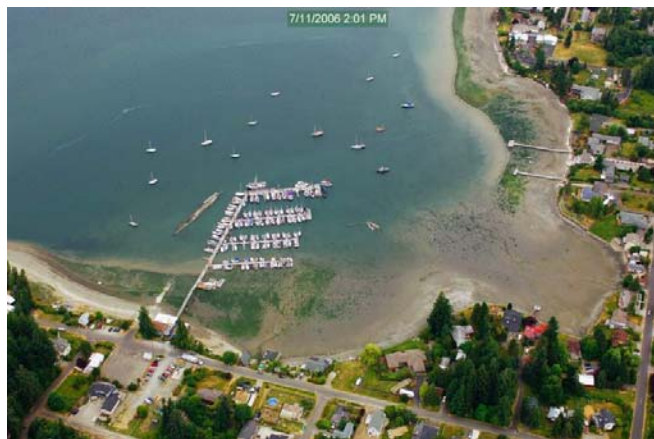
Boston Harbor view from the air

Everyone else was involved in other activities apparently, so the group was small, but sometimes that is good for getting better acquainted with those who do attend.