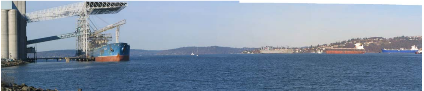
Commencement Bay coming out of Foss Waterway – site for 2008 TALL SHIPS July 3 – 7